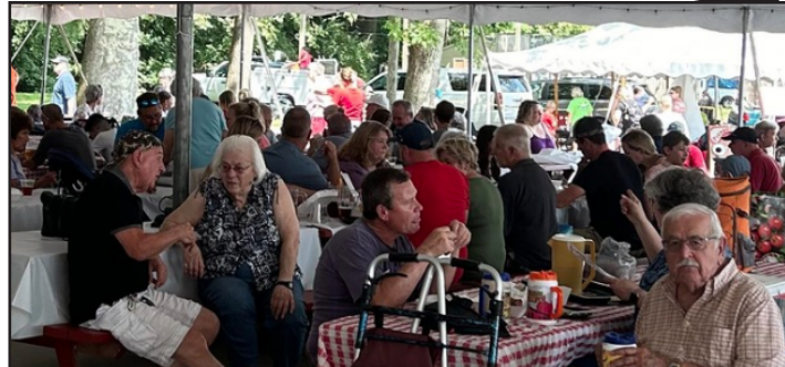
More than 1,000 picnic attendees enjoyed this year's event at Willow Glen

● Gate/Parking Crew suggested that we have Entrance/Exit Signs made. and agreed some parking donations were lost due to those attending the flea market. Despite